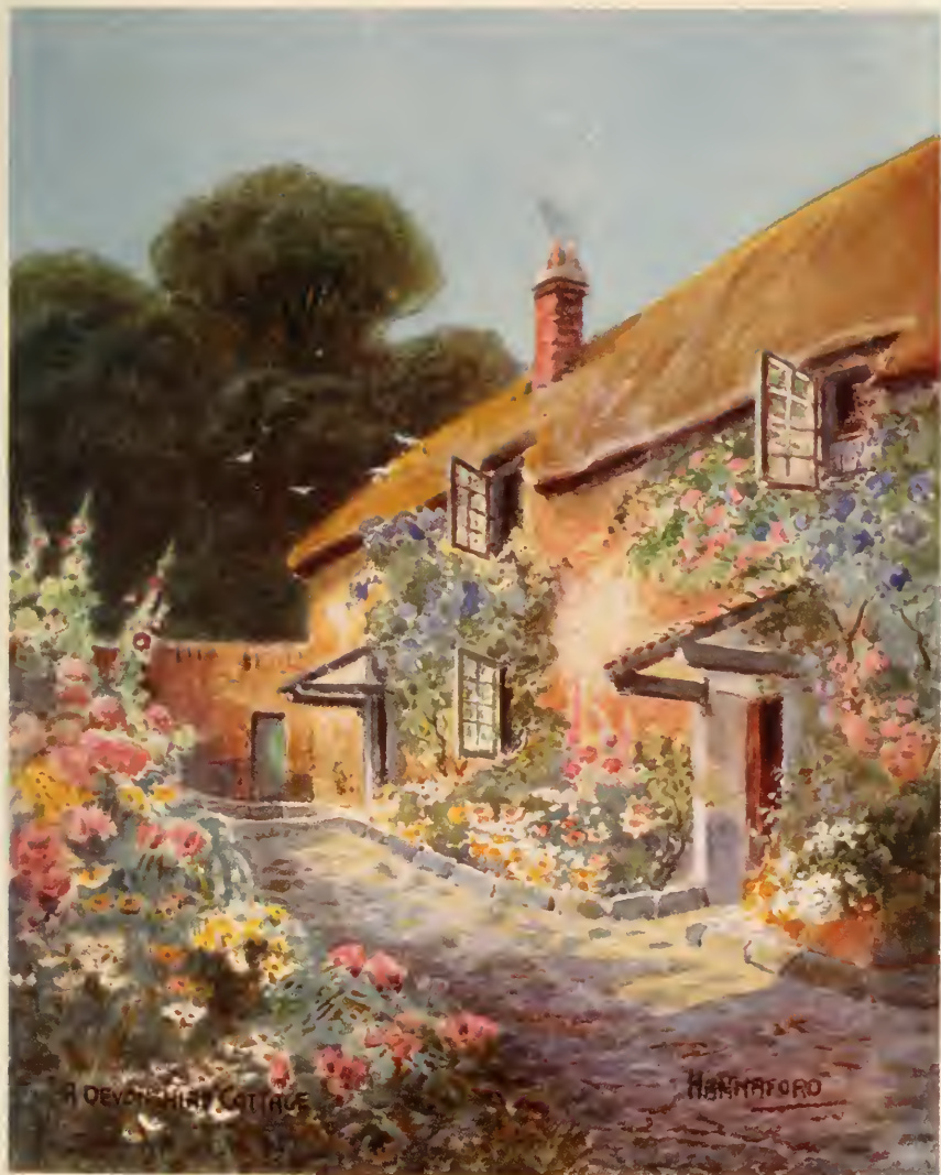
A DEVONSHIRE COTTAGE